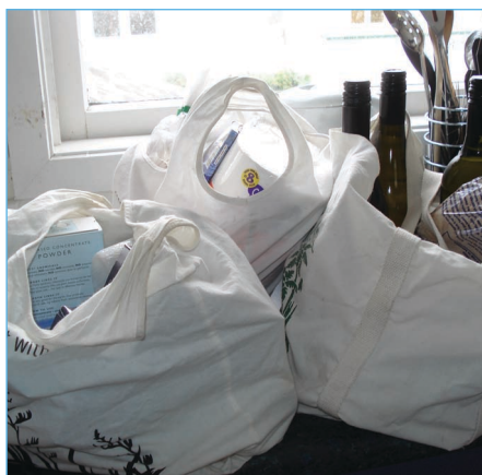
Use re-usable bags

Start a compost heap or worm farm, then put it to use on plants or in your garden. Free Create Your Own Eden courses are available to help Manukau residents learn more about this. You will receive a $20 discount voucher to purchase a compost or worm bin when you complete it. Find out more at www.manukau.govt.nz