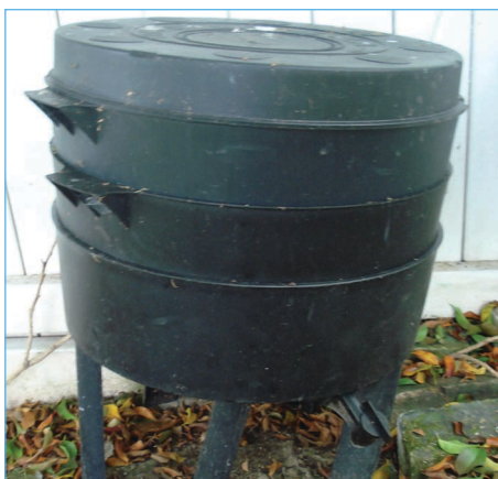
Start a compost heap or a worm farm